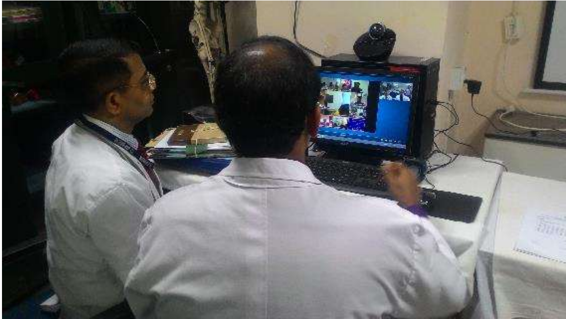
Figure 3: Video Conferencing APAN43 meeting between JIPMER Kyushu University, Japan held on 18th January 2017