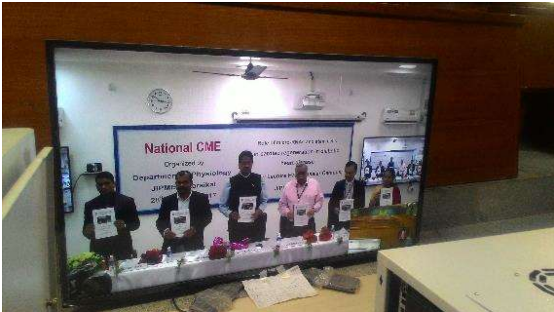
Figure 4: Video Conferencing on National CME Session between JIPMER, Puducherry and JIPMER, Karaikal held on 28 th February 2017.