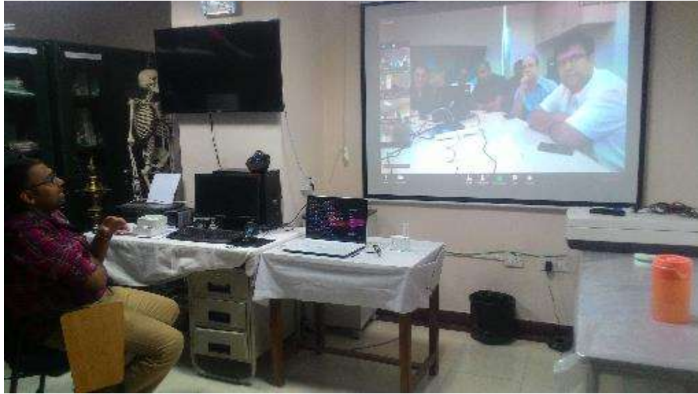
Figure 5: Video Conference Session of Tumor Board meeting between JIPMER and Tata Memorial Hospital held on 4th March 2017