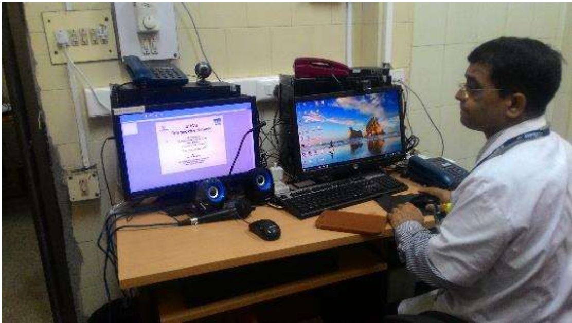
Figure 2: ISRO Tele-CME Session between JIPMER and GCS Medical College, Hospital & Research Centre, Ahmedabad held on 6 th July 2016.