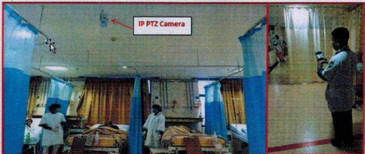
An IP PTZ Camera in position with Doctor monitoring the patients online in his Mobile

JIPMER received a communication from Ministry of Health & Family Welfare (MOHFW), Govt. of India, New Delhi to submit details of Concept of 'Remote Online Bedside Monitoring' existing in JIPMER to be implemented at National Level in other Govt. Institutions & Hospitals of the Country. JIPMER has Remote Online Bedside Monitoring System established in tertiary burns unit of the Department of Plastic Surgery. Two way communication system is being done in most of the intensive care units for patients, visitors and relatives communication, and monitoring and infection prevention.