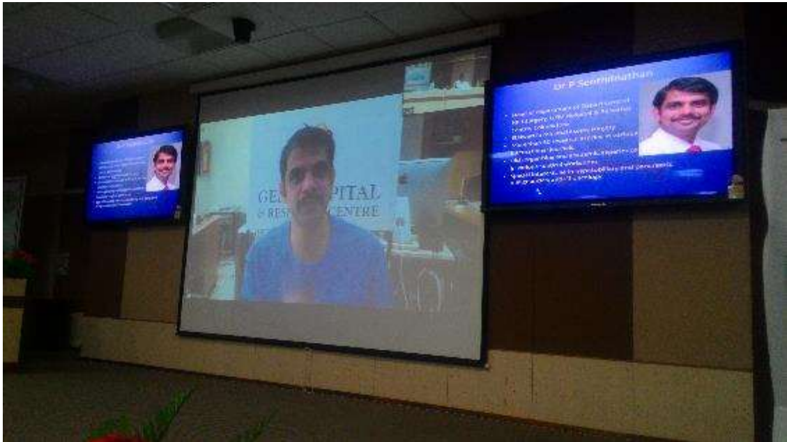
Figure 7: Video Conferencing Online lecture on “Surgery Update 2017” between JIPMER and GEM Hospital & Research Centre, Coimbatore held on 18 th February 2017.