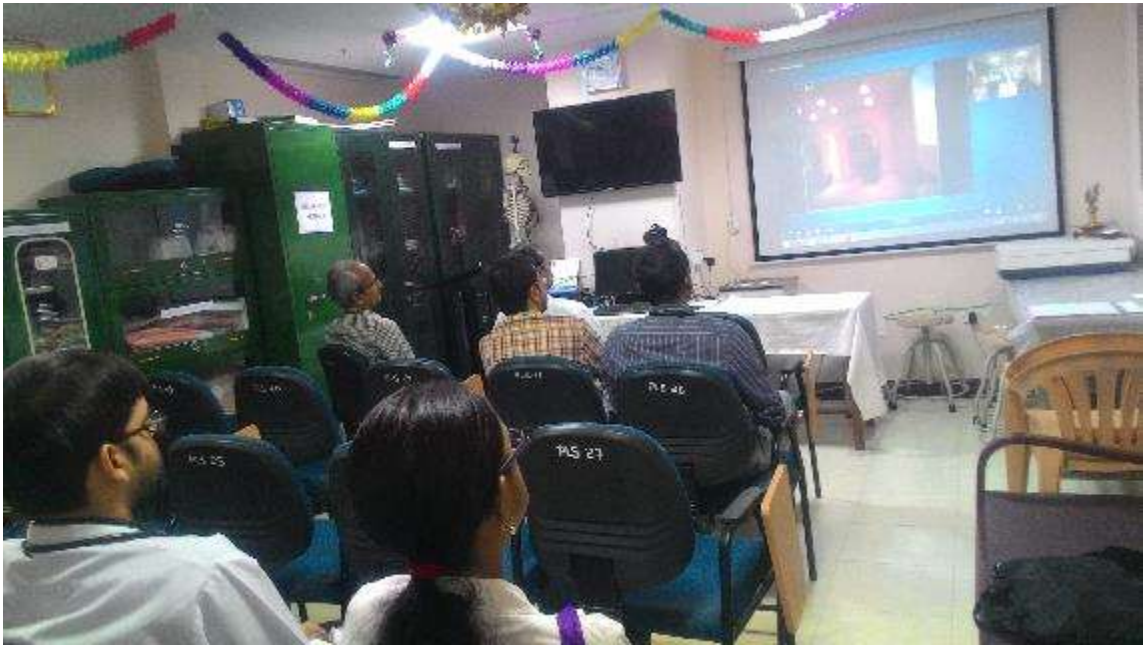
Figure 8: Video Conferencing Teaching Tele-CGR Sessions between JIPMER and SGPGI Lucknow