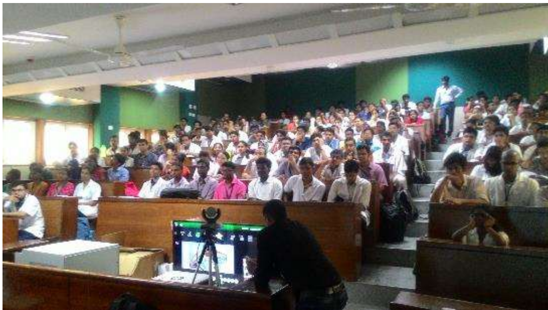
Figure 6: Medical Virtual Class Room (MVCR) Sessions between JIPMER, Puducherry and JIPMER Karaikal campus held on 22 nd March 2017.