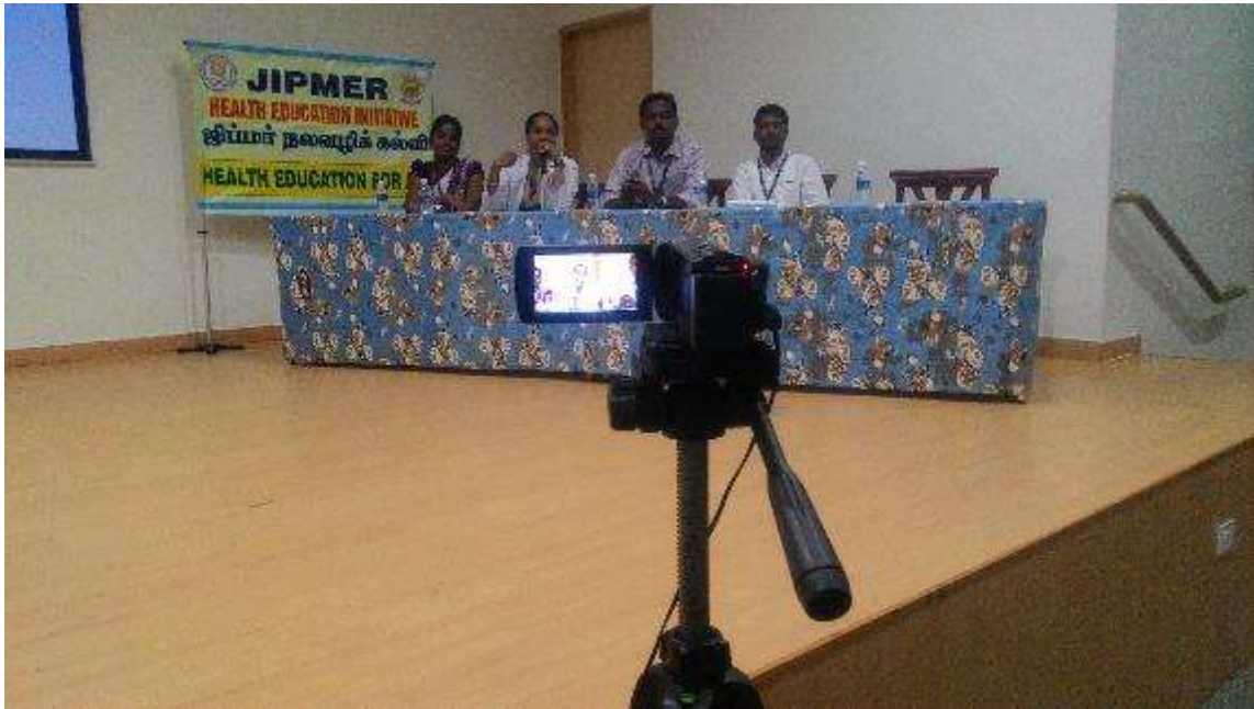
Figure 1: Live Telecast of Health Education Programme from JIPMER to Medical Colleges of South India held on 28 th June 2016.