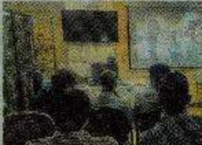
The first virtual tumour board meeting took place on October 10, 2020. The board will discuss cases of cancer and will discuss cases of cancer.

has been JIPMER's first virtual tumour board. The board, which will discuss cases of cancer, is the first of its kind in the country. The board consists of a group of cancer specialists and experts in radiotherapy, surgery, medical oncology, palliative care, geriatric oncology and allied specialties who will discuss cases of cancer. The board will meet on a regular basis to discuss cases of cancer. The board will discuss cases of cancer and will discuss cases of cancer. The board will discuss cases of cancer and will discuss cases of cancer.